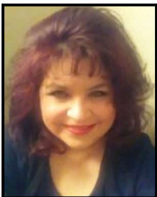
Lady Zafara Baabur Minister of Arts & Sciences