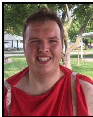
Lord Gaius Cornelius Scipio Titianus Web Minister