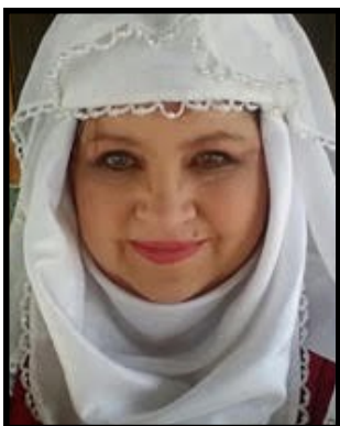
Lady Zafara Baabur Minister of Arts & Sciences